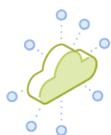
Lift and Shift

Migrate applications from private to public clouds without expensive and time-consuming re-architecture.